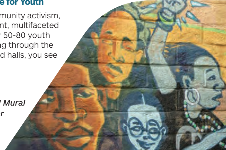
Youth-painted Mural at RYSE Center

He adds, "We are actively in the process of shaping our community, not just theorizing. It's exciting."