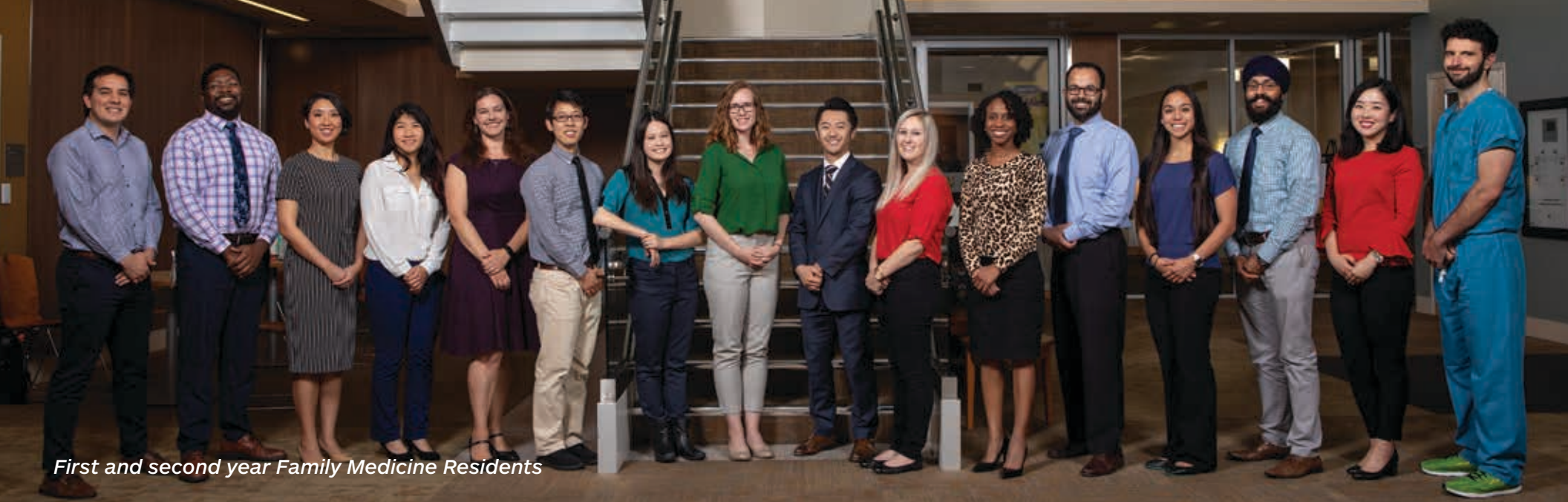
First and second year Family Medicine Residents